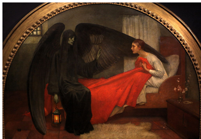
Figure 2 La jeune fille et la mort , Marianne Stokes, 1908, Musée d'Orsay, Paris. https://commons.wikimedia.org/wiki/File:La_Jeune_Fille_et_la_Mort-Marianne_Stokes-IMG_8224.JPG

Perhaps it is fanciful, but when I listen to this music, I cannot help but hear the struggle of an individual facing news that death is coming. The quiet, spare plangent notes of the G minor theme, seem awfully reminiscent of the silence that follows the breaking of terrible news. We then hear a series of variations that convey an increasingly frenzied and frenetic struggle against inevitable mortality.